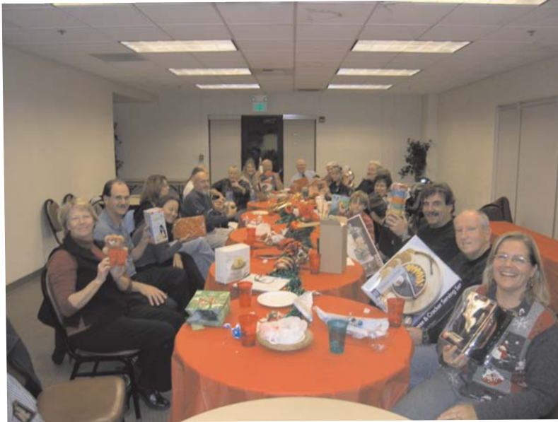
Holiday Potluck &- gift swap was a big howling success. Many laughs were shared.